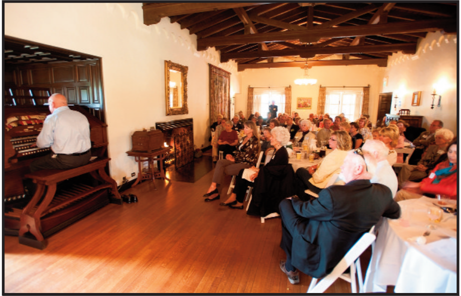
Holiday concert, 2011, with organ recital at Kellogg House Pomona.

The current board has proposed a new set of programs for Pace Setters, which include the creation of an email newsletter, which began in Fall 2011, a website, an upcoming student scholarship fund, a Need-a-Ride program, as well as a holiday