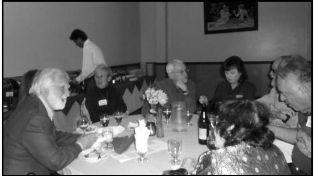
One of the tables at the CSU Dominguez Hills' Emeriti Faculty Association's Ethnic Dinner, 2012